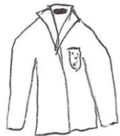
Coat ( N/P nametape on collar)