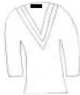
Cricket Jumper ( W/B )