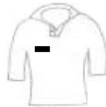
Cricket Shirt ( W/B )