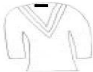
Cricket Jumper (W/B)