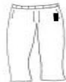
Cricket Trousers (W/B)