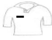
Cricket Shirt (W/B)