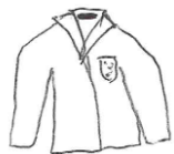
Coat (N/P nametape on collar)