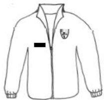
Reversible Waterproof/ Fleece ( N/P nametape on Fleece side)

The items marked with a * in this Clothes List MUST be obtained either via the Home Farm or the Elstree School Uniform Shops.