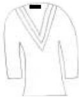
Cricket Jumper ( W/B )