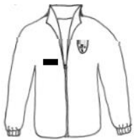
Reversible Waterproof/ Fleece ( N/P nametape on Fleece side)