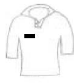
Cricket Shirt (W/B)