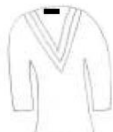
Cricket Jumper (W/B)